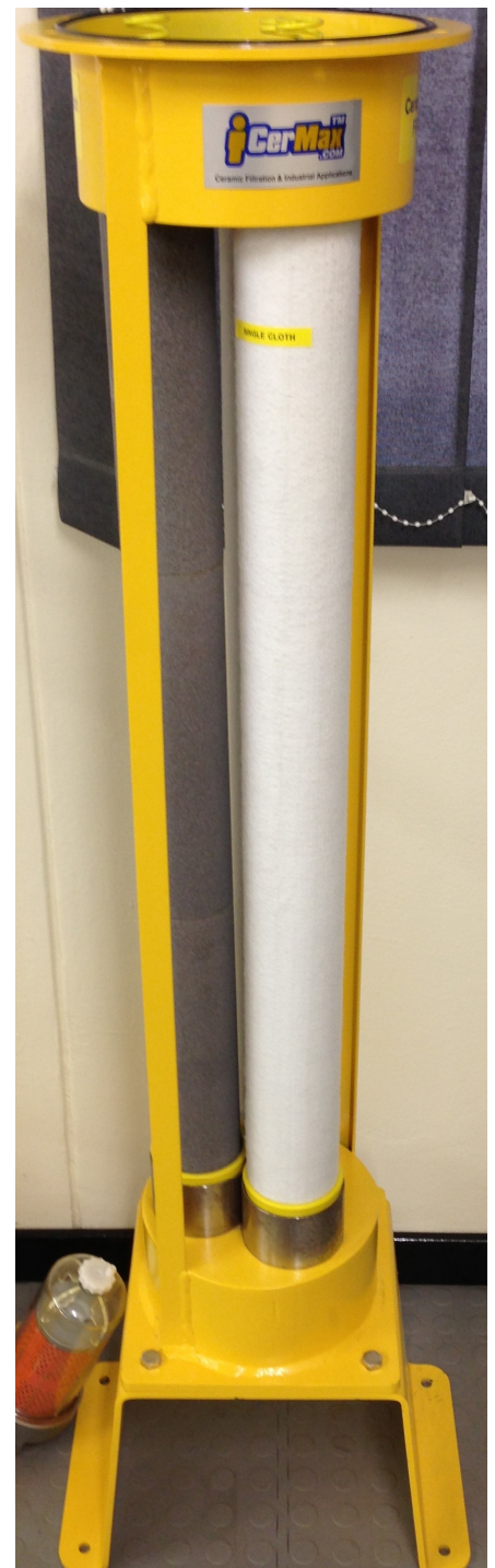
Side view inside